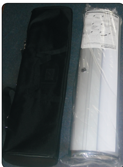
Executive Rolla Banner